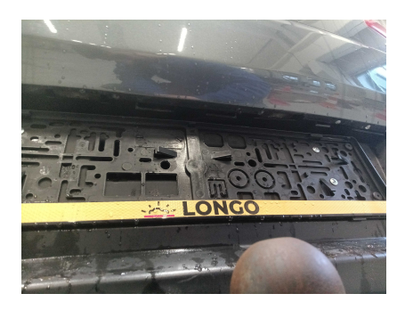
2. REAR: Rear bumper - condition and alignment