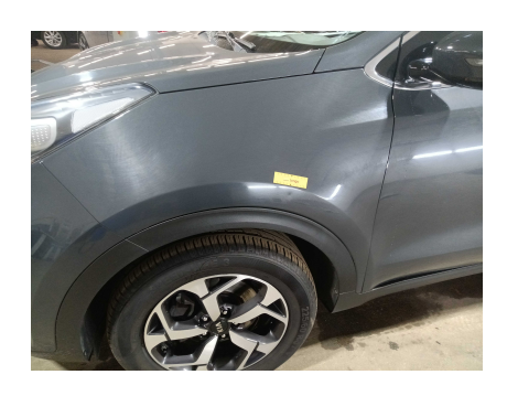
2. OTHER: Additional polishing tasks