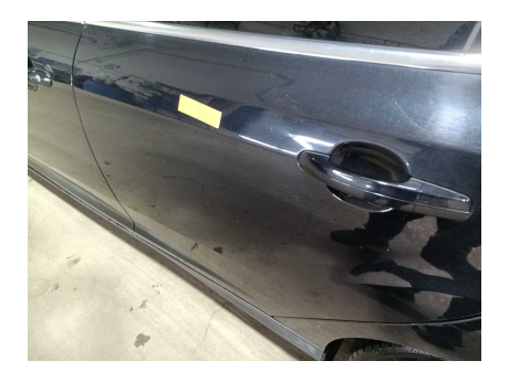
3. SIDE: Left and right side - visual damage / scratches

2. SIDE: Left and right side - visual damage / scratches