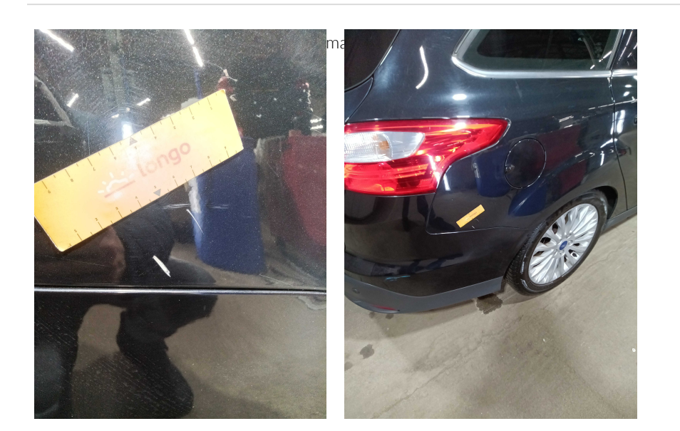
6. SIDE: Left and right side - visual damage / scratches