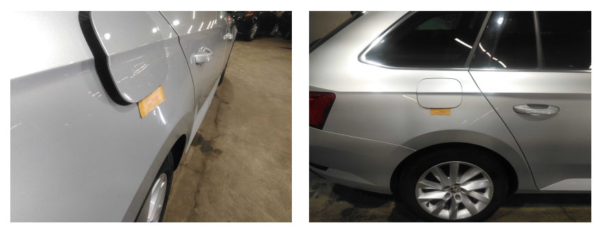
2. SIDE: Left and right side - visual damage / scratches

1. SIDE: Left and right side - visual damage / scratches