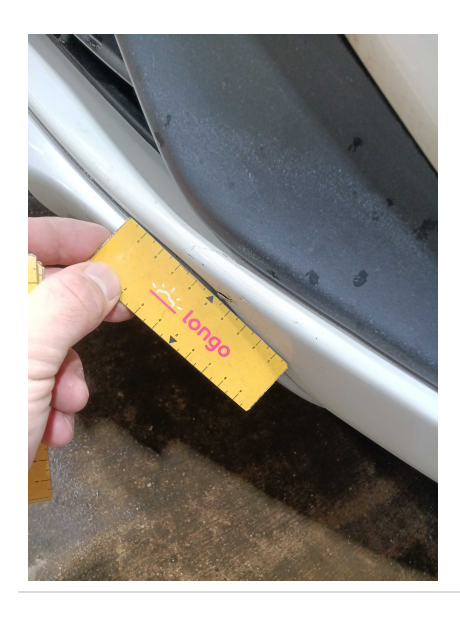
3. FRONT: Front bumper - condition and alignment