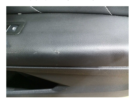
1. DOORS: Trims - condition