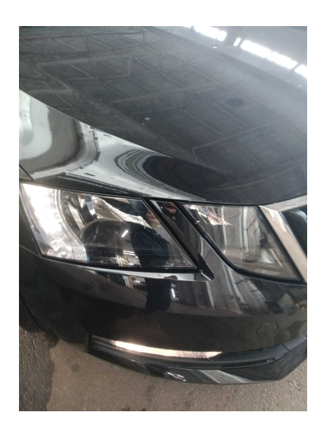
4. FRONT: Front grill - condition