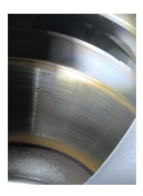
2. BRAKES: Rear brake pads (all)