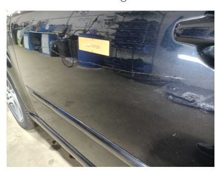
1. SIDE: Left and right side - visual damage / scratches