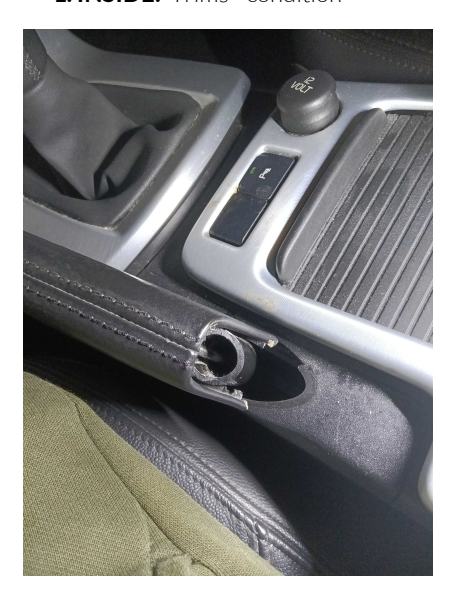
2. INSIDE: Armrest - operation and condition