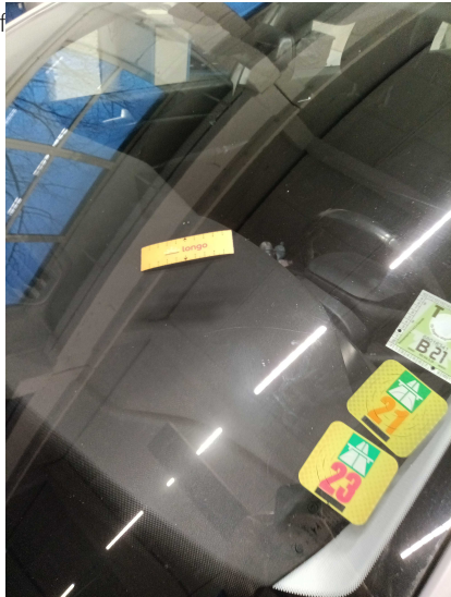
re f vehicle from MOT test