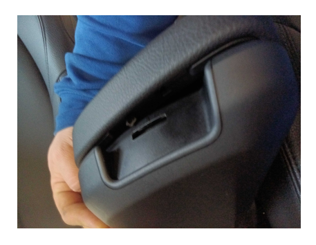
2. SEATS: All seats - condition

1. INSIDE: Armrest - operation and condition