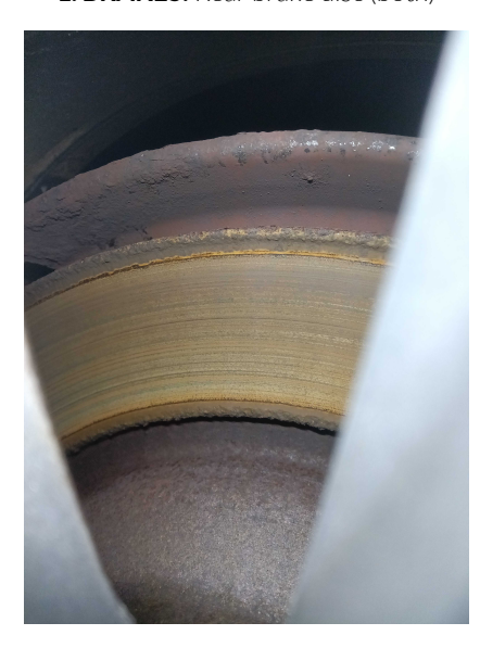
2. BRAKES: Front brake disc (both) - including pads