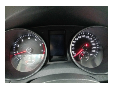
2. INSIDE: Trims - condition

1. FRONT: Dashboard - condition; operation of buttons