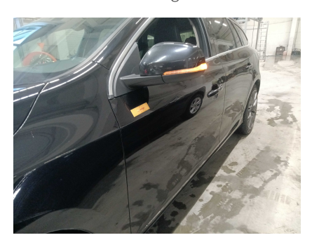
2. LIGHTS: Front lights (city, regular and full headlight, fog, indicator) - basic functioning, damage, color

1. SIDE: Left and right side - visual damage / scratches