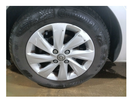
3. SIDE: Left and right side - visual damage / scratches