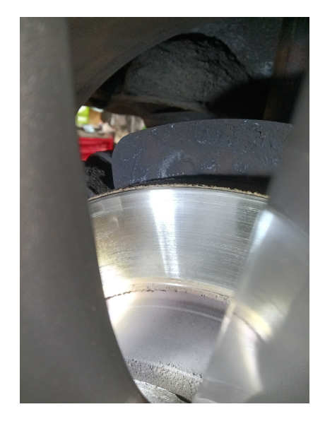
3. SUSPENSION: Suspension lower arm