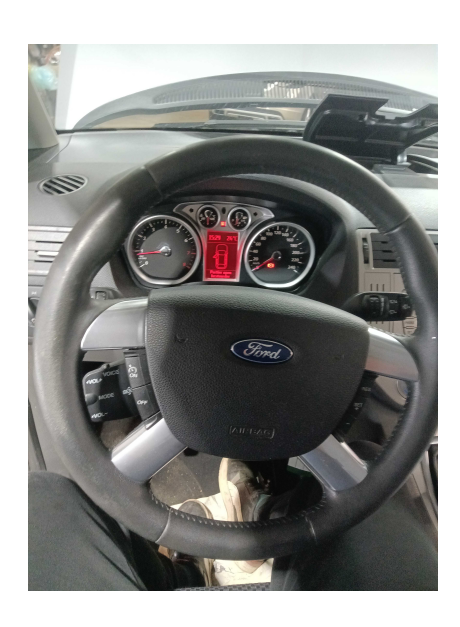
4. FRONT: Dashboard - condition; operation of buttons