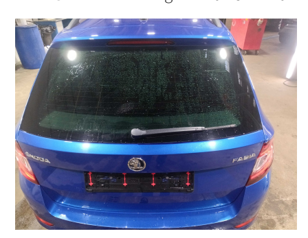
2. REAR: Rear bumper - condition and alignment

1. OTHER: Locking mechanism on all doors and trunk, including fuel hatch