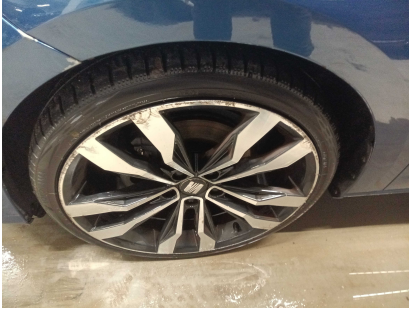
7. SIDE: Left and right side - visual damage / scratches