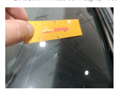
2. SIDE: Left and right side - visual damage / scratches

1. FRONT: Windscreen integrity - free from any damage that would exclude the vehicle from MOT test