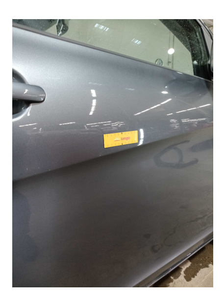
6. SIDE: Left and right side - visual damage / scratches