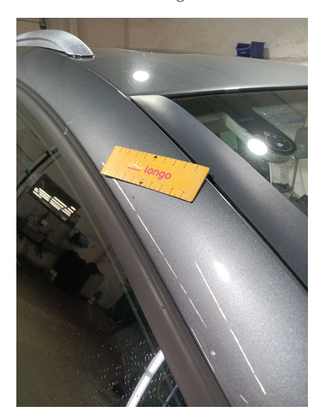
7. OTHER: Roof - visual damage (e.g., hail damage)