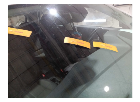
2. FRONT: Hood - visual damage

1. FRONT: Windscreen integrity - free from any damage that would exclude the vehicle from MOT test