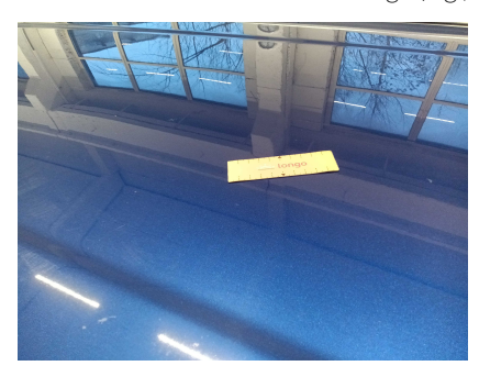
1. OTHER: Roof - visual damage (e.g., hail damage)