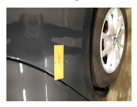
2. REAR: Rear bumper - condition and alignment

1. SIDE: Left and right side - visual damage / scratches