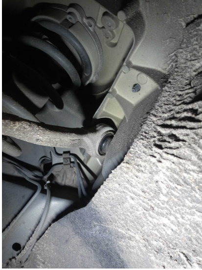
arm, rear (both)