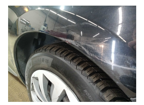
6. FRONT: Hood - visual damage

5. SIDE: Left and right side - visual damage / scratches