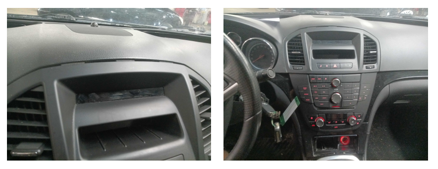
2. FRONT: Steering wheel - condition