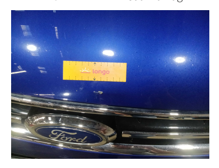
1. FRONT: Hood - visual damage