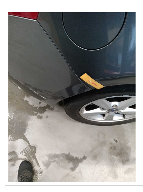
4. REAR: Trunk - visual damage