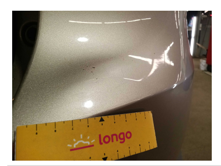
8. FRONT: Hood - visual damage