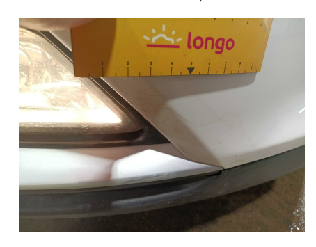
3. FRONT: Front bumper - condition and alignment