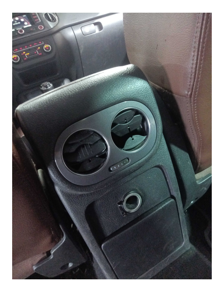
2. SEATS: All seats - condition