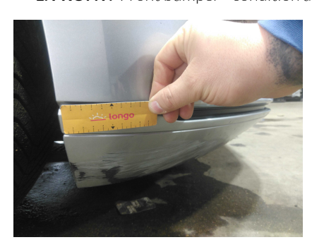
2. REAR: Rear bumper - condition and alignment

1. FRONT: Front bumper - condition and alignment