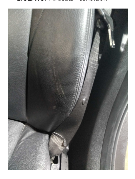
1. SEATS: All seats - condition