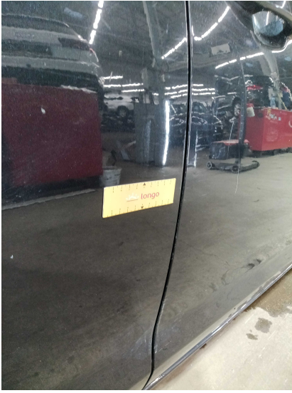
6. SIDE: Left and right side - visual damage / scratches