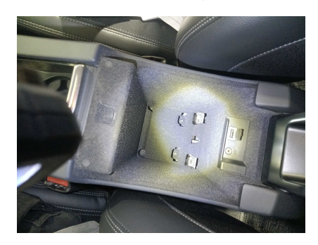
2. INSIDE: Armrest - operation and condition

1. INSIDE: Armrest - operation and condition