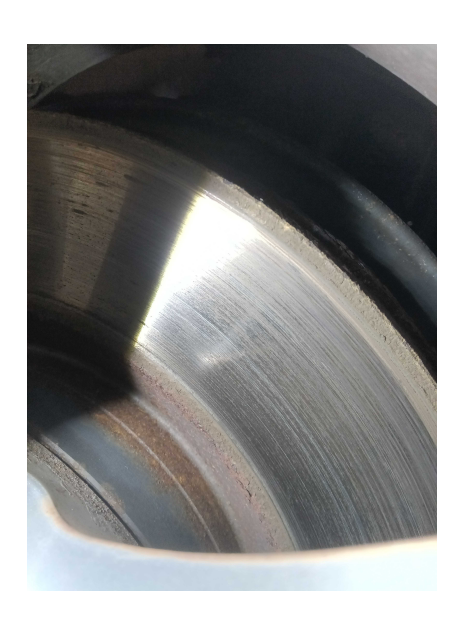
2. BRAKES: Rear brake disc (both)