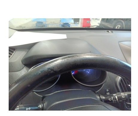
1. FRONT: Steering wheel - condition