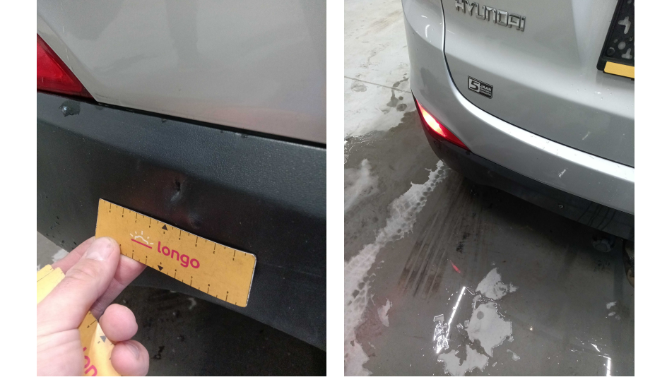
3. REAR: Trunk - visual damage