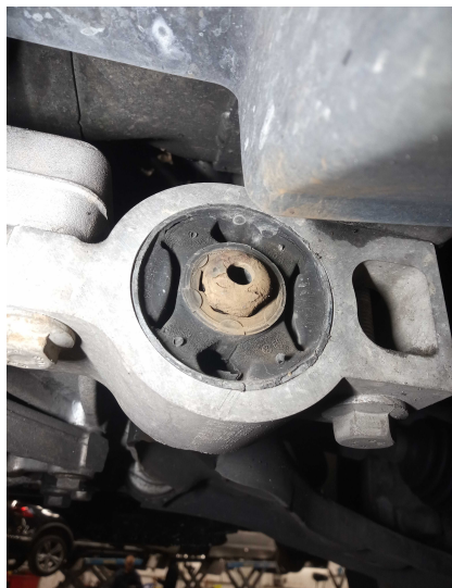
rm bushes (both)