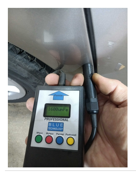
4. SIDE: Left and right side - visual damage / scratches