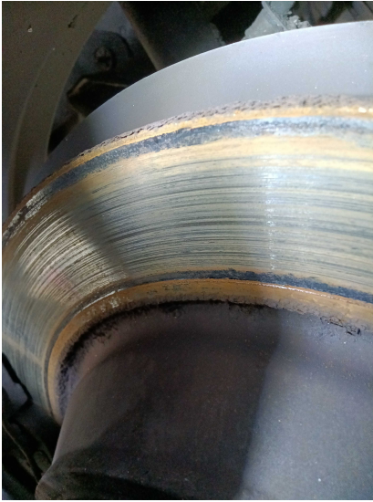
2. BRAKES: Front brake disc (both) - including pads