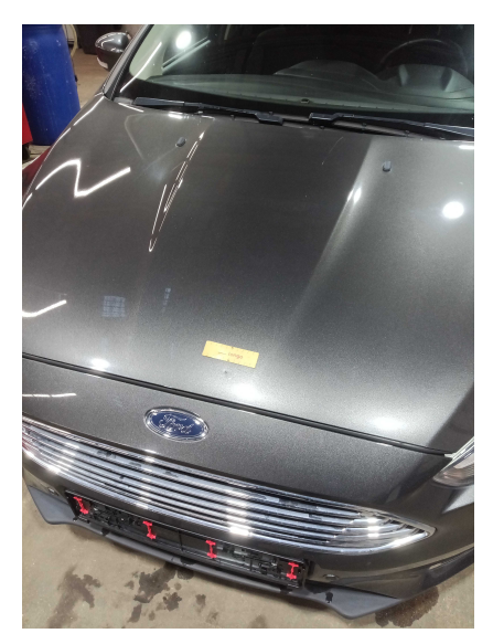
2. FRONT: Front bumper - condition and alignment