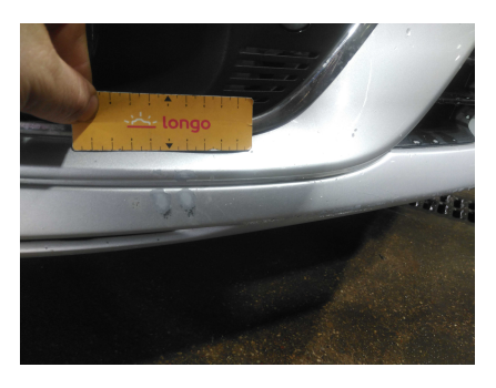
2. FRONT: Hood - visual damage

1. FRONT: Front bumper - condition and alignment