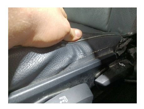
1. SEATS: All seats - condition