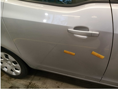
4. SIDE: Left and right side - visual damage