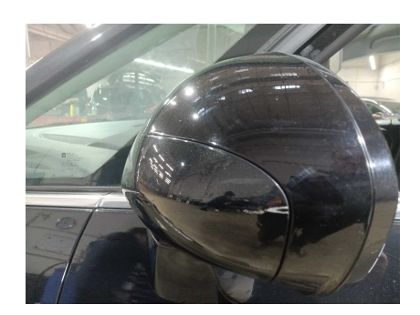
3. SIDE: Left and right side - visual damage / scratches