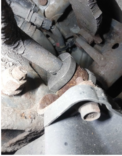
3. SUSPENSION: Suspension lower arm