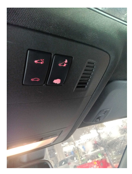
2. INSIDE: Trims - condition