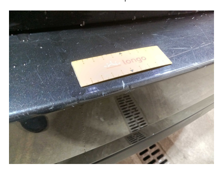
1. REAR: Rear bumper - condition and alignment