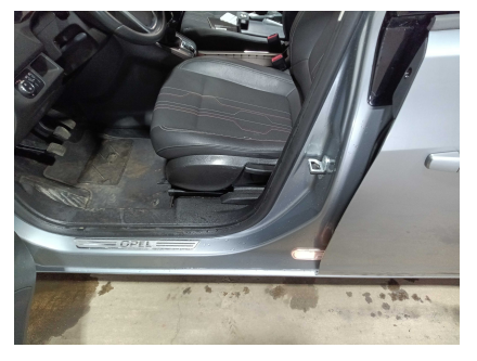
3. FRONT: Trims - condition