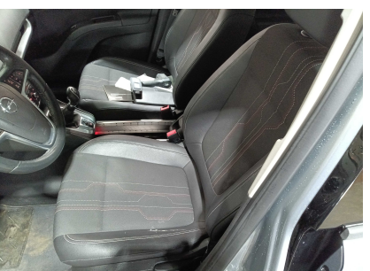
2. SEATS: All seats - condition