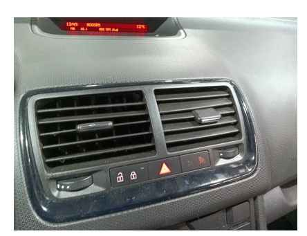
Diagnosis report of 2013 OPEL MERIVA Anniversary Edition Stock ID: N784716