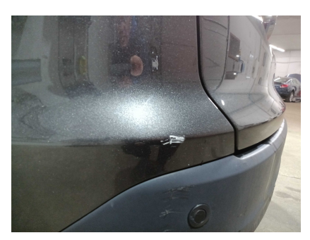
6. REAR: Rear bumper - condition and alignment