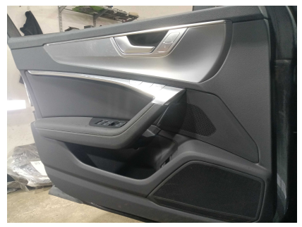
2. FRONT: Trims - condition